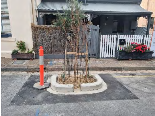
Ada Street Greening